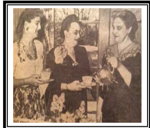
1944 Spring Tea Up-Dos, Brooches & Corsages