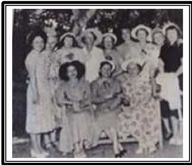
1950 Garden Party Installation White peep-toe shoes, gloves and hats