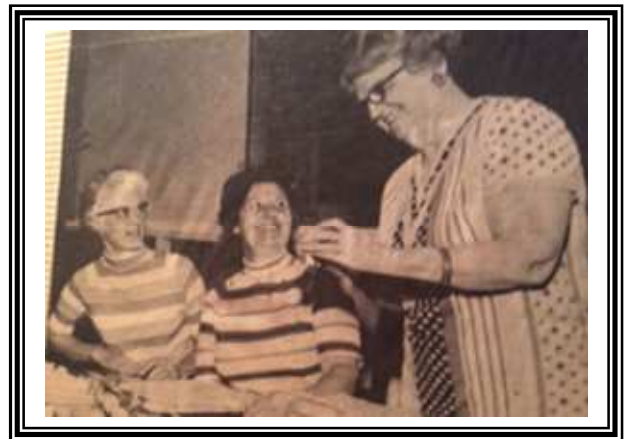
Nov. 1971 - "Holiday Flair" Set Up Yikes!!! Sweaters and stripes, and more stripes and even MORE stripes!