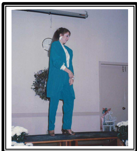
Current fashion of the 1980's at AWC – big shoulders, long jackets