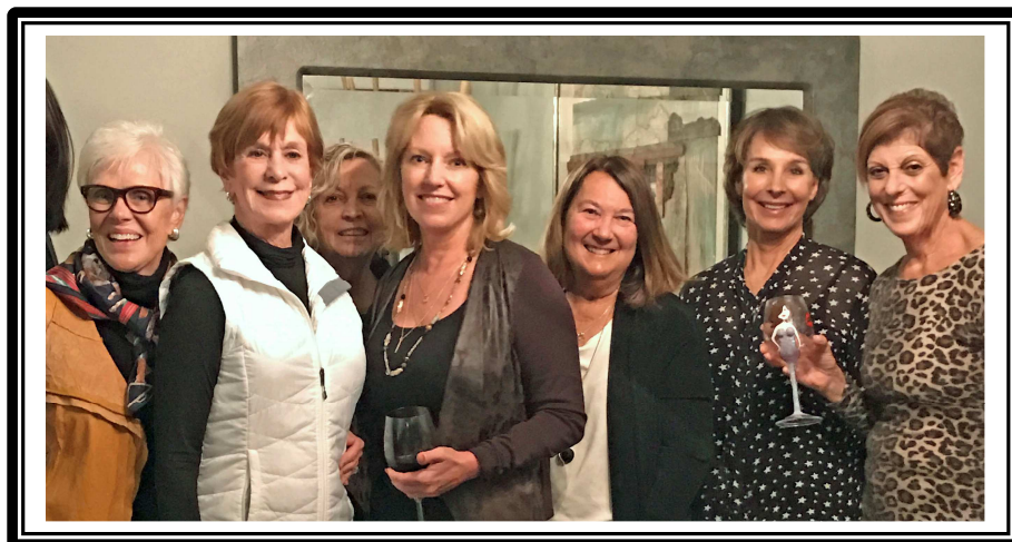
Dec 2016 "Toys for 'Tini's" Party Current members stylishly sporting latest fashions!