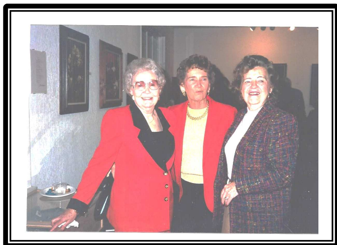
1990's Jackets, jackets and MORE jackets!